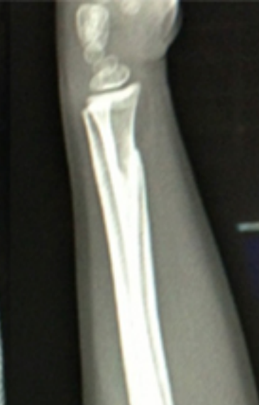
4 months After