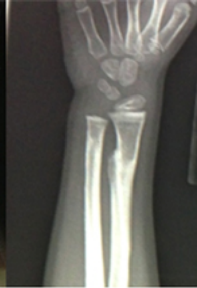
4 months After