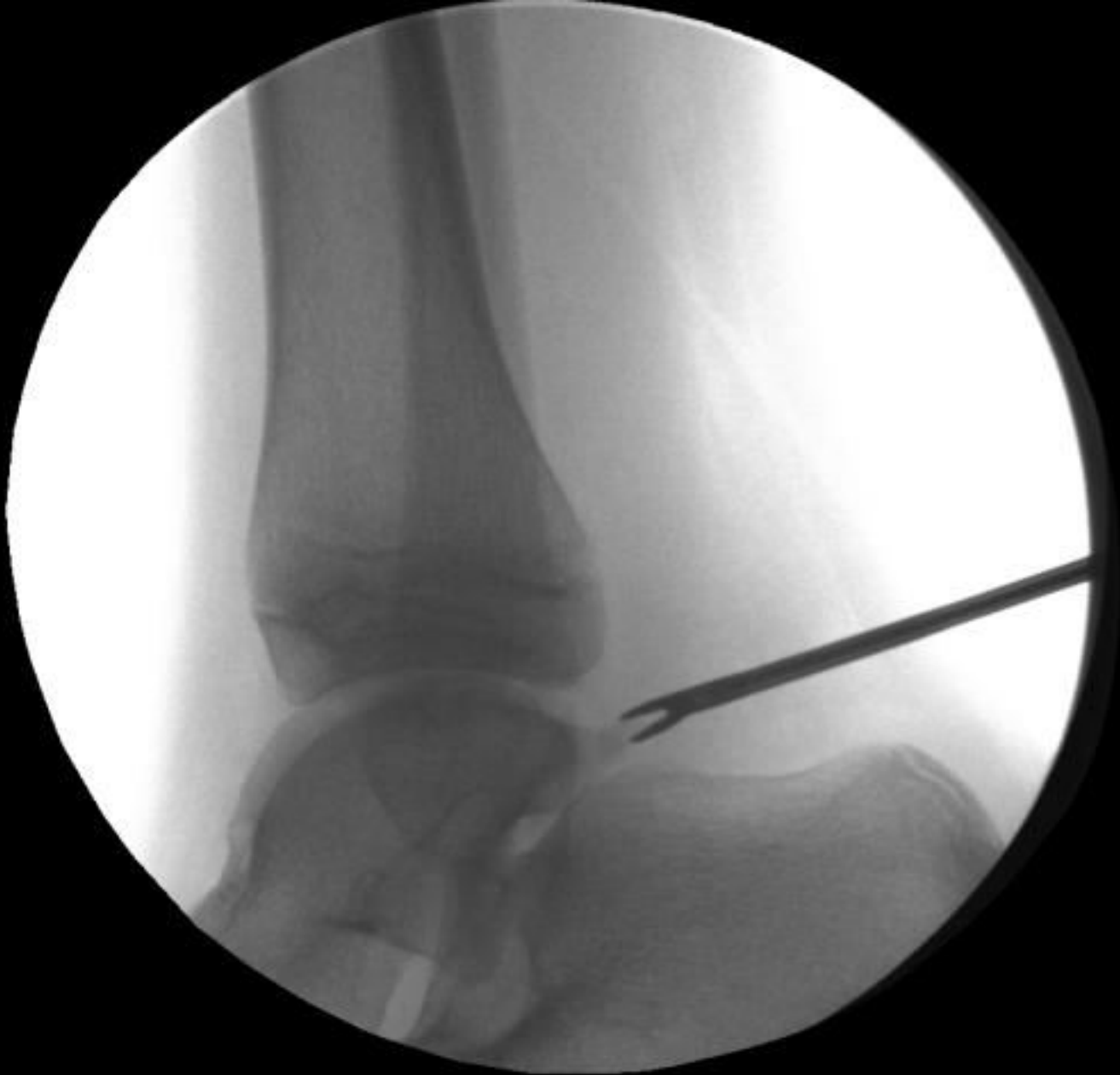
Removal with Arthroscopic Grasper