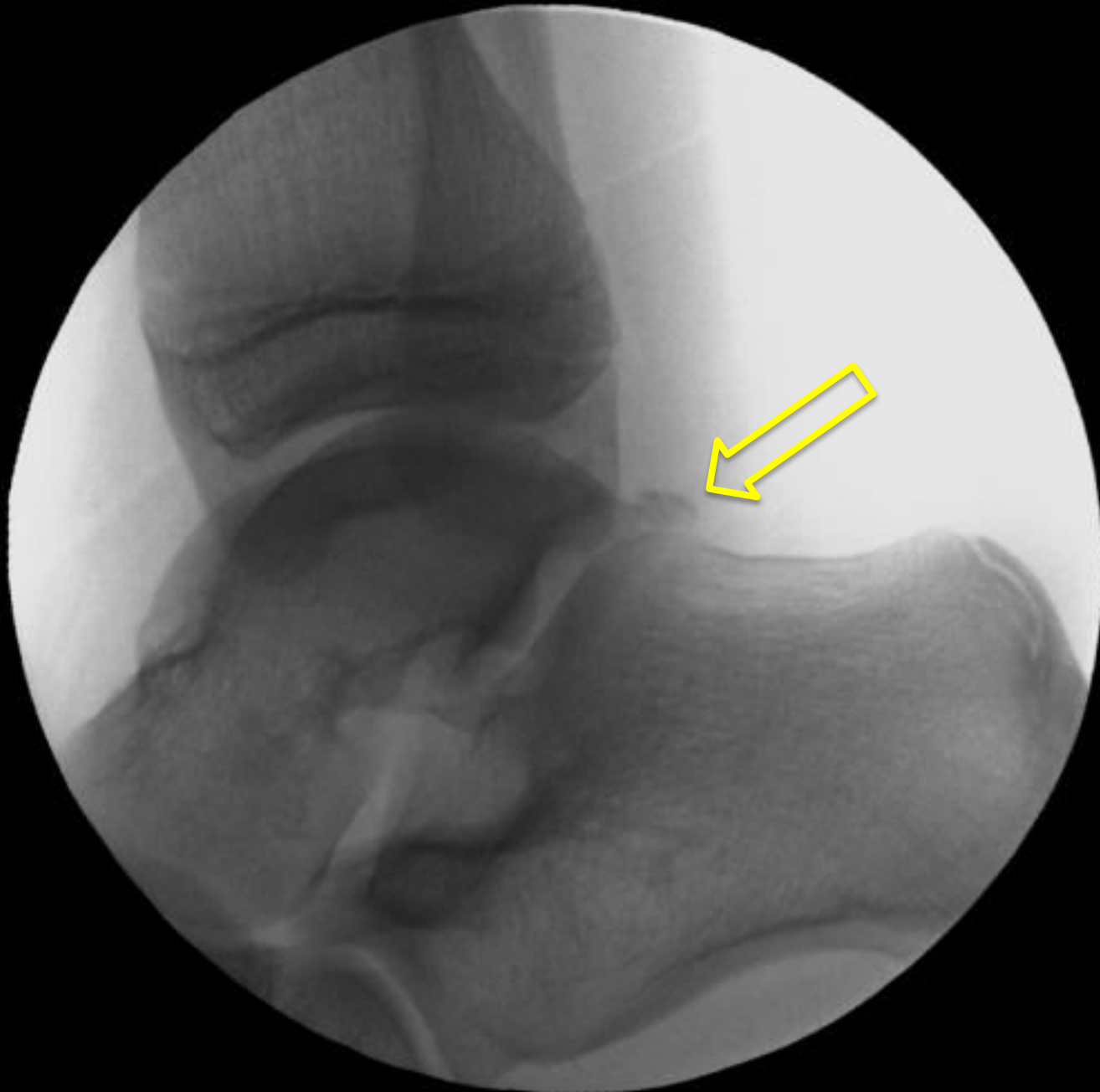
Intra-operative X-Ray of Os trigonum