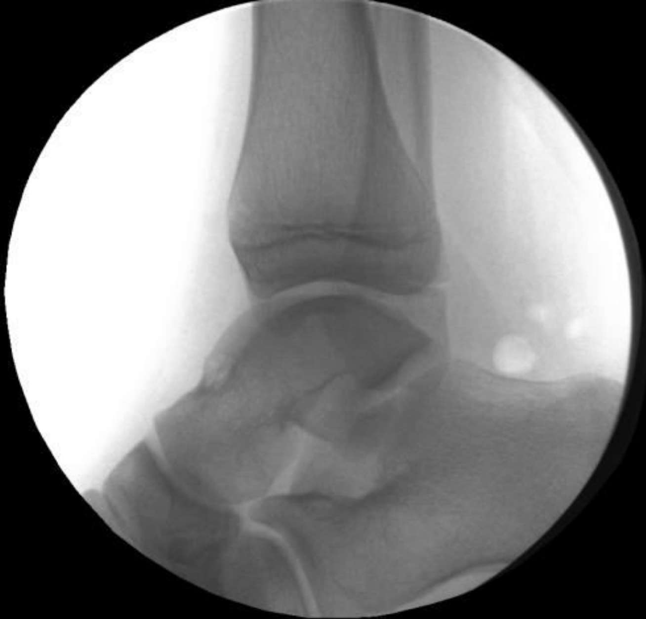
Intra-operative X-Ray following resection of Os trigonum