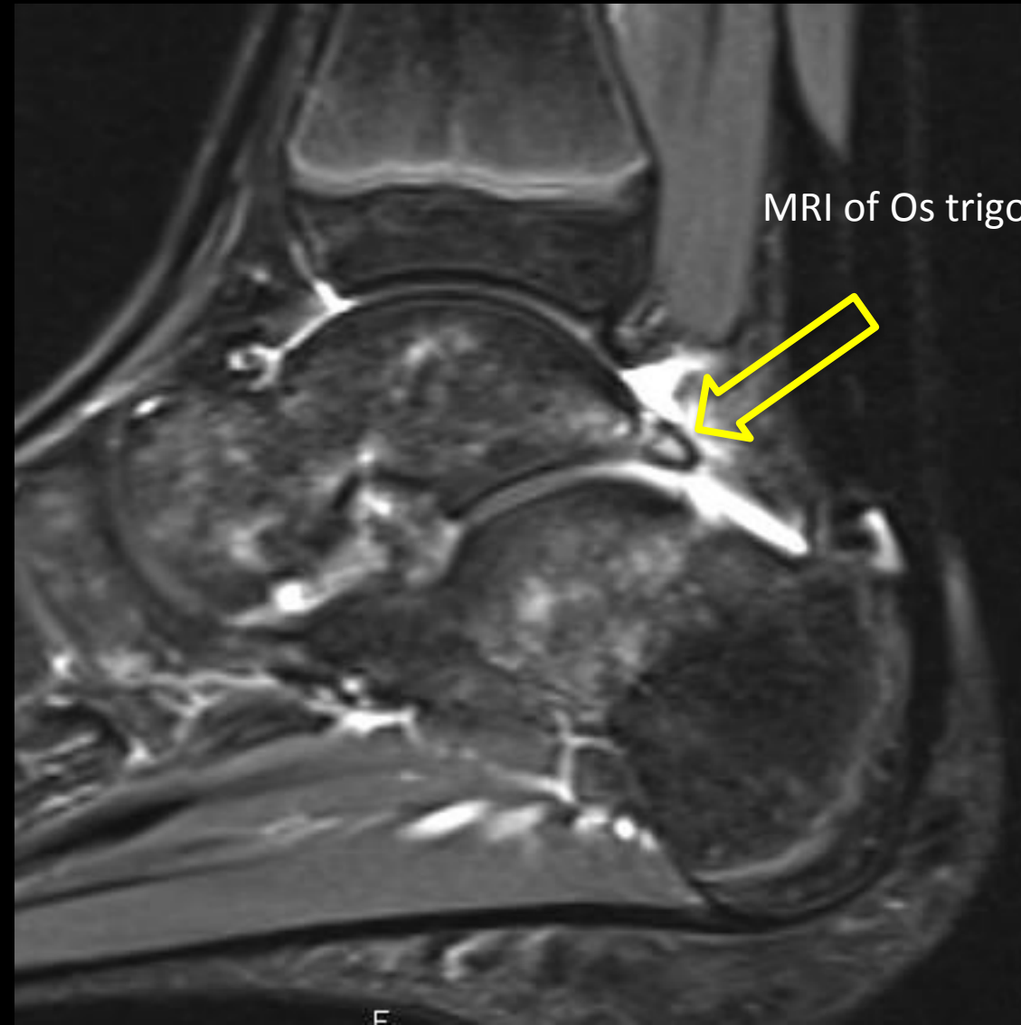
MRI of Os trigonum with surrounding swelling (white)