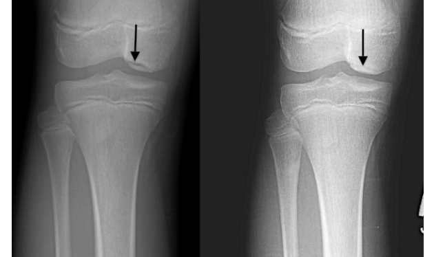
12-year-old girl with initial injury (left) and 3 months post-surgical treatment/drilling (right)